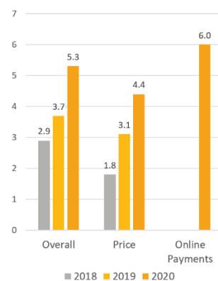
Customer Satisfaction Scores