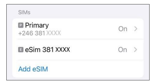
How an eSIM will look on your iPhone Shown alongside a regular SIM

During this initial post launch period physical SIMs will remain our primary way of connecting you to our Sure4G network. As for physical SIMs, you must come into our shop to sign-up for service to use an eSIM.